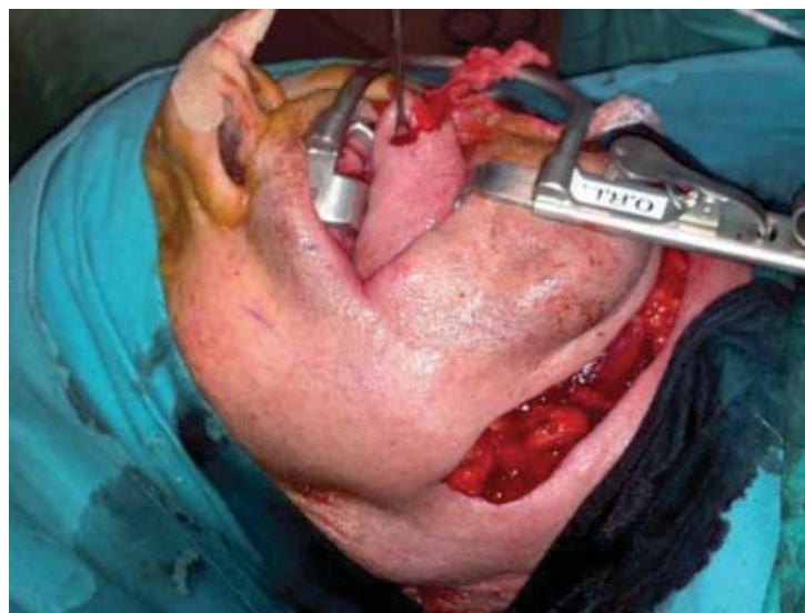
Fig. 3. Flap is dissected and passed through a tunnel from the origin of the pedicle into the oral cavity

On the 3 rd postoperative day the patient suffered an acute non-Q-wave myocardial infarction. With drug therapy the patient's condition was brought under control and no significant consequences were observed. The patient was started on a liquid oral diet on postoperative day 4 and advanced to a regular diet on day 6.