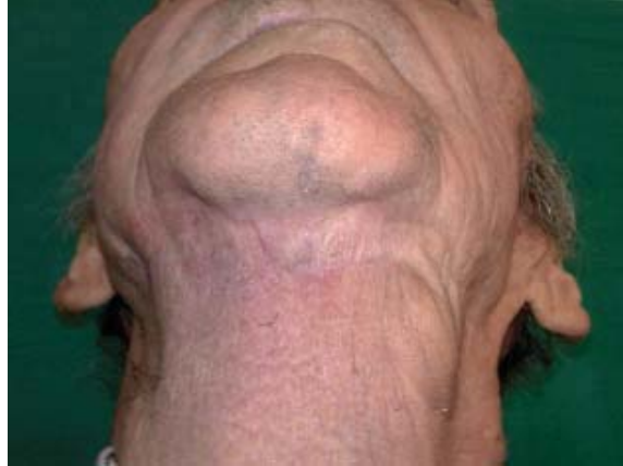
Fig. 5. The donor site scar 1 month after the surgery