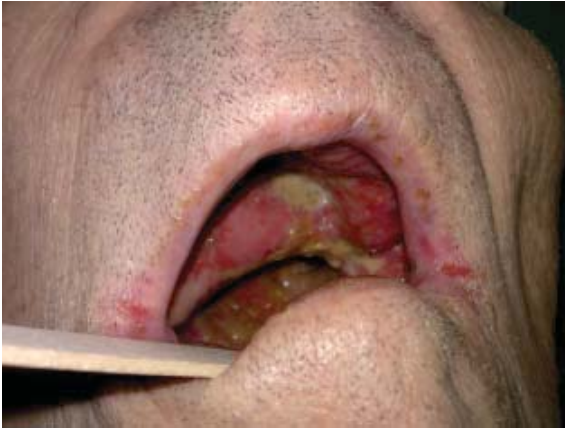
Fig. 4. The reconstructed palate 1 month after the surgery

One month postoperatively, a good reconstructive result in terms of anatomy and function was presented (Fig. 4). The donor site was healed with minimal cosmetic deformity (Fig. 5).